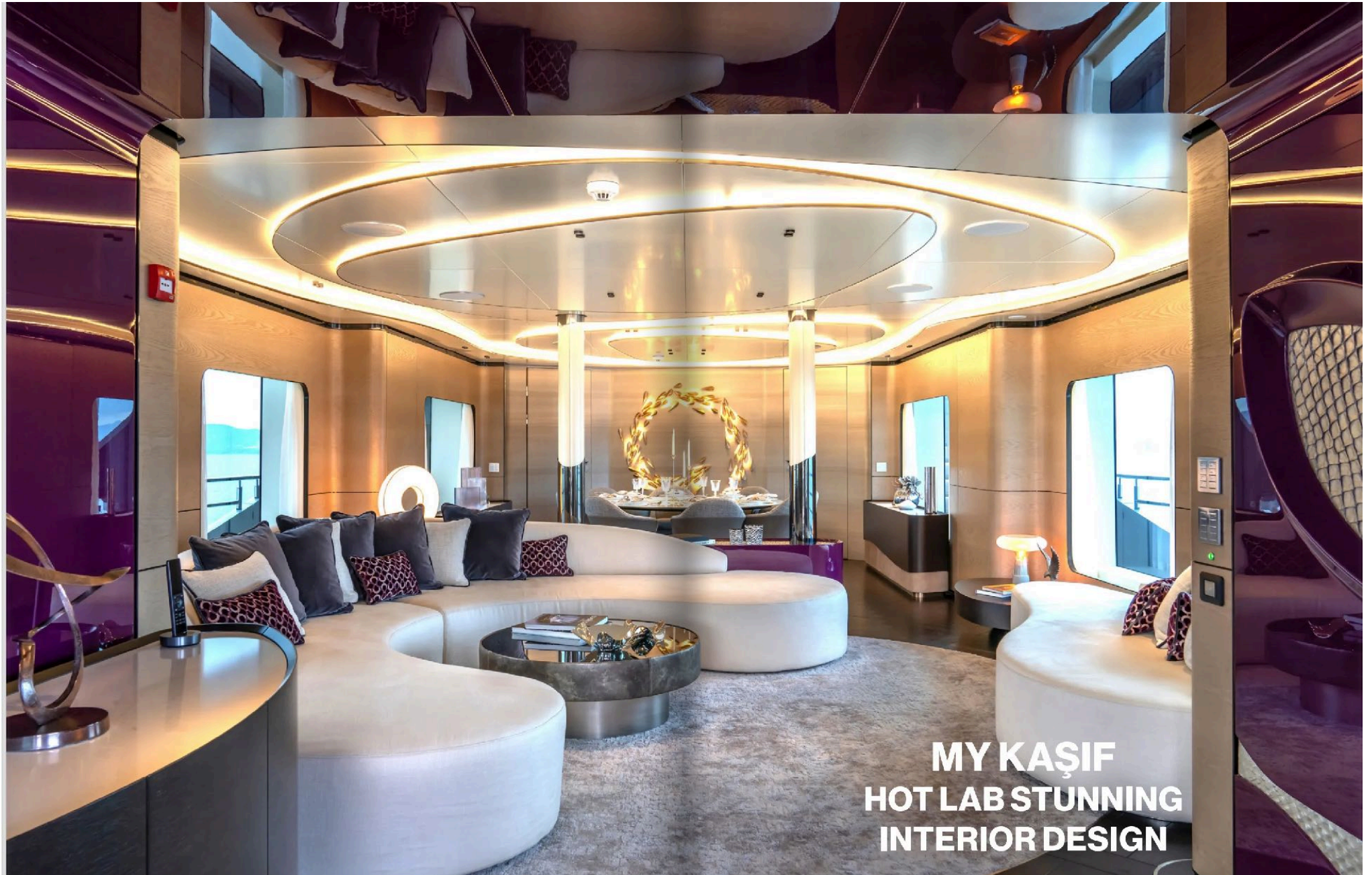
MY KAŞIF HOT LAB STUNNING INTERIOR DESIGN