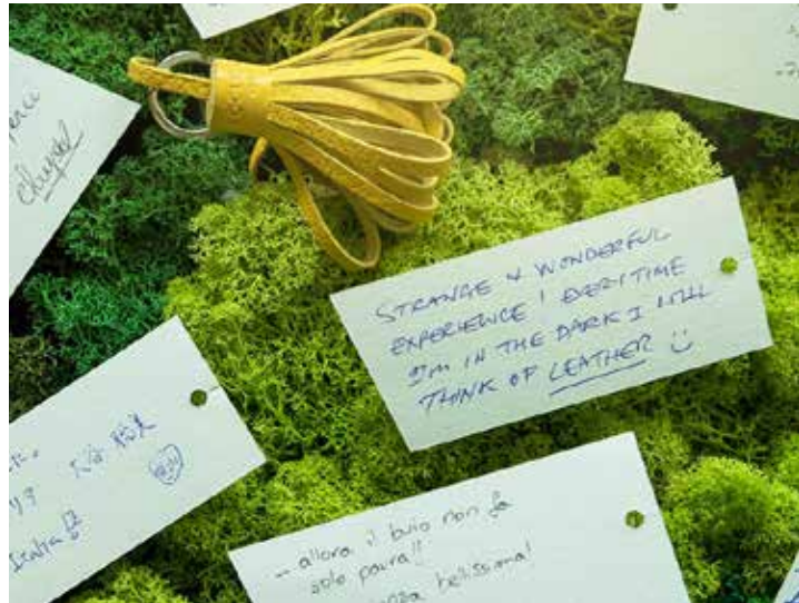
VISITOR COMMENTS AT THE FOGLIZZO EVENT